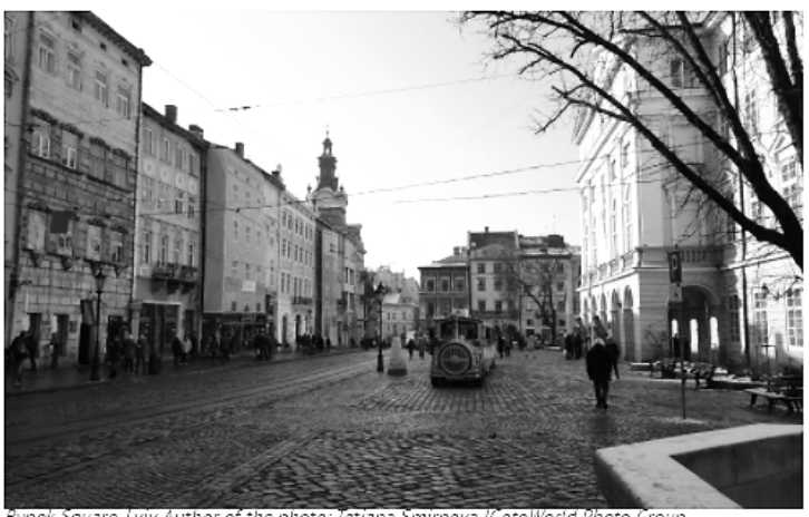
Rynok Square, Lviv.

The first mention of the central city square dates back to the distant 13th century. For many centuries it has been the center of the city's life. Cultural events, processions were organized here, and vegetables, fruits and flowers grown by local residents were sold on the market.