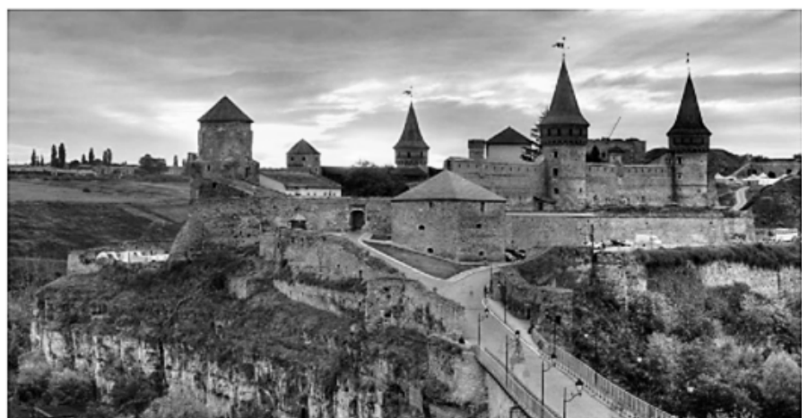
On the photo: Kamianets-Podilskyi Castle.

7. Forget about castles. You won't find any. And even those that existed, have long been destroyed.