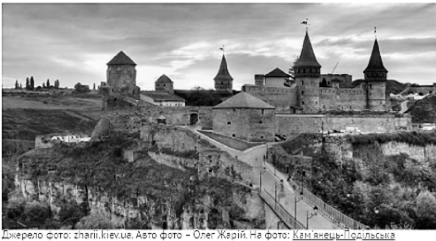
На фото: <u>Кам'янець-Подільська</u> <u>фортеця</u>.

7. Про замки забудьте. Їх немає і ніколи не було. А навіть ті, що були, вже давно знесли.