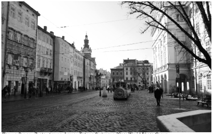
Площа Ринок, Львів.

Перші згадки про центральну міську площу датуються далеким 13 століттям. Багато віків вона була центром життя міста. Тут влаштовували культурні заходи, процесії, продавали на ринку овочі, фрукти і квіти, які вирощували місцеві жителі.